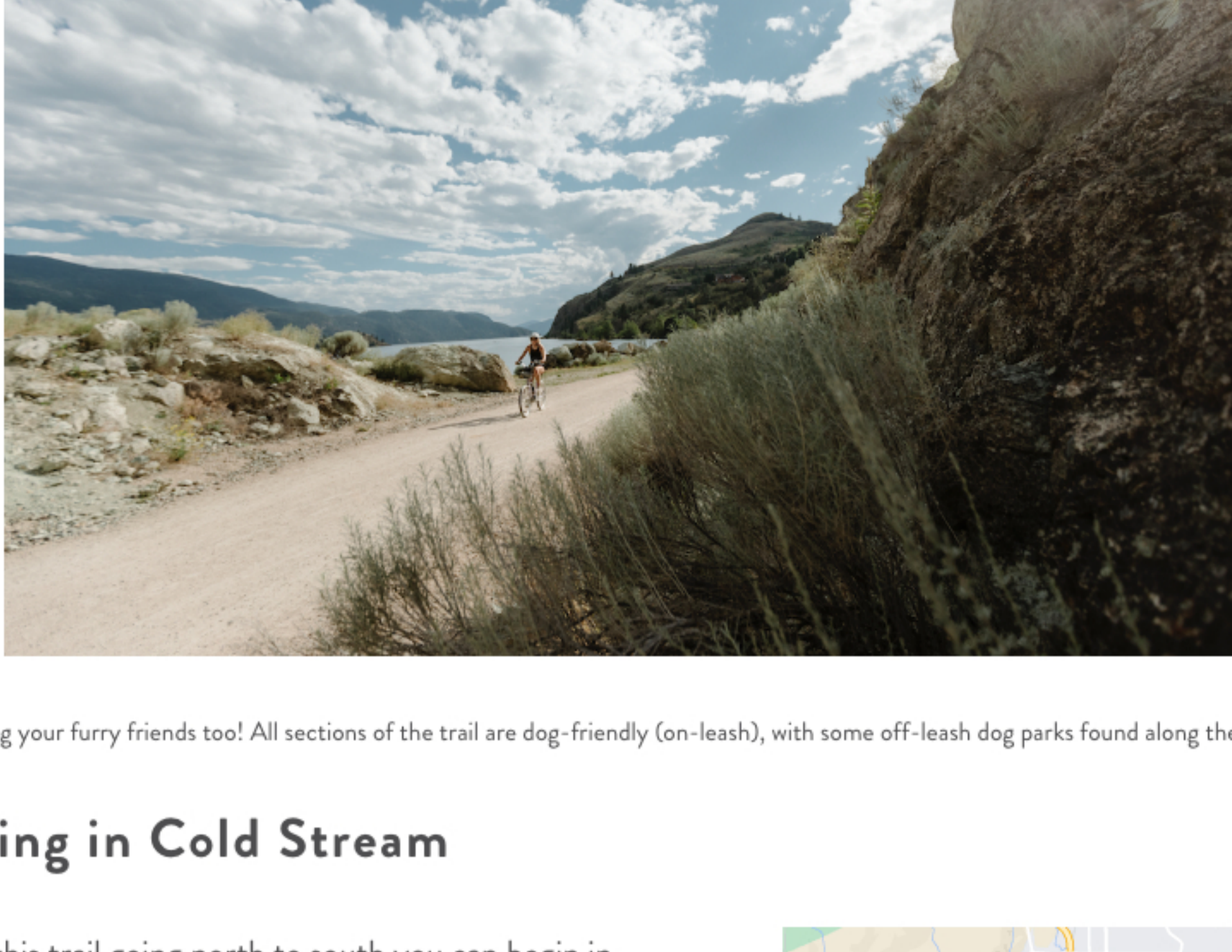
Bring your furry friends too! All sections of the trail are dog-friendly (on-leash), with some off-leash dog parks found along the way.

This recreational trail has many routes to start your adventure at. One of my favourites is the Cold Stream to Kekuli Bay 20 km (12.5 mi) and Kekuli Bay to Lake Country 22.8 km (14 mi) . These trails are flat and well graded making them easily walkable and accessible to mobility aids, or if you are interested in completing it in one day, it is perfect for a bike. These trails also offer great camping sites throughout, an excellent spot, halfway through the trail along Kalamalka Lake, you will find Kekuli Bay Campground .